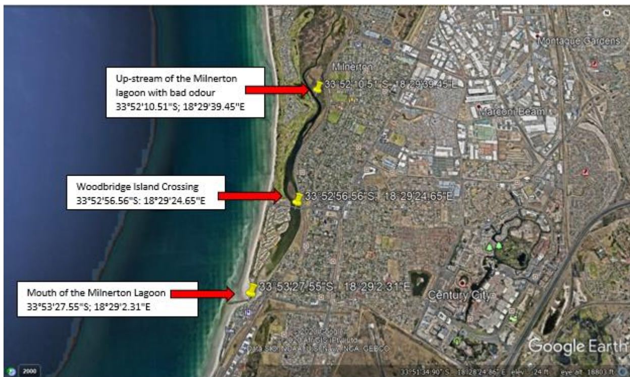
Aerial photography 2: Areas of Concern with highly polluted water and offensive odour