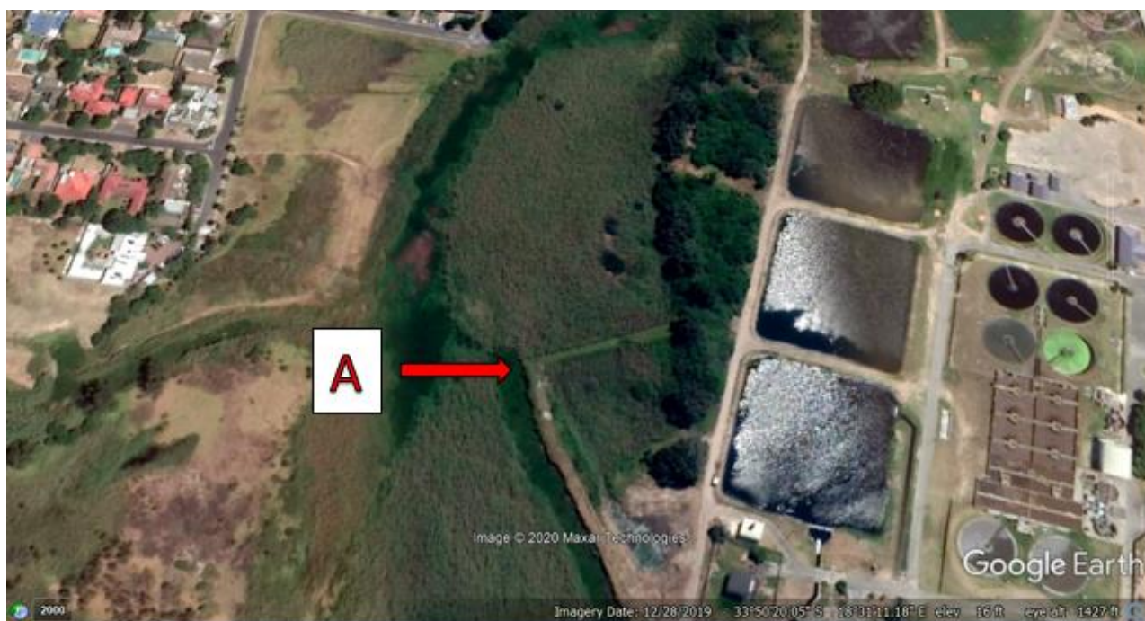
Aerial photography 4: Possible source of pollution to the Diep River and Milnerton Lagoon