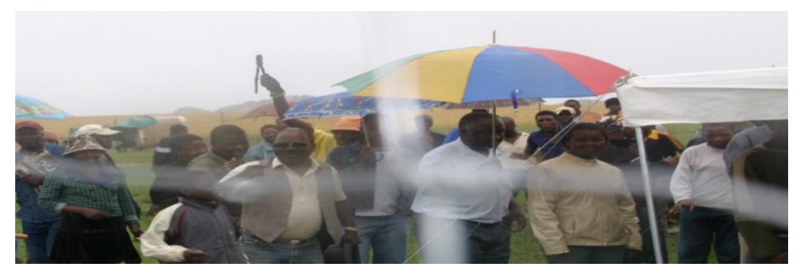
Fig 4: Crowds gathered outside Nkomazi Reserve on 1 December 2005 to force owners of the Nkomazi Reserve to recognise unlawful land claims.