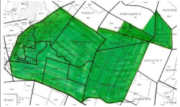
Fig 2 : Map of properties gazetted by MRLCC on 22 May 2004.