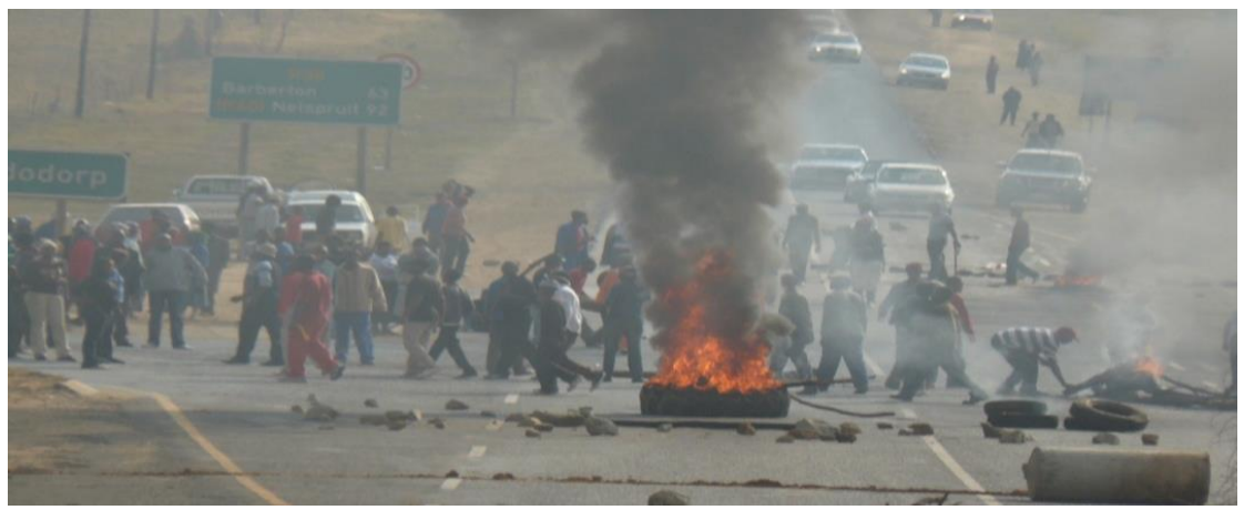
Figure 5: Travelport assault on 2 August 2008.