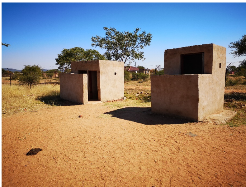
Figure 3.1: Old toilets at Ncheleleng Secondary School