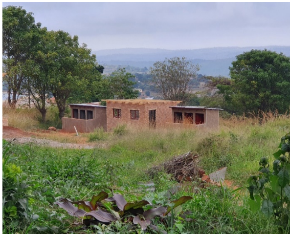
Figure 6.1 Old toilets on both sides of the new toilets under construction.