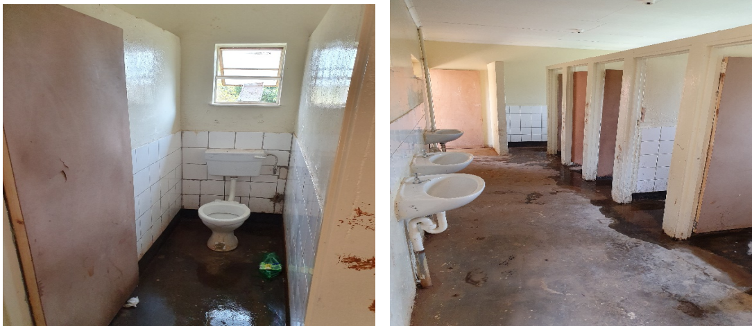
Figure 8.1: The current state of the newly “renovated” toilets.

There was no evidence of the construction of new toilets as is apparent from the pictures above.