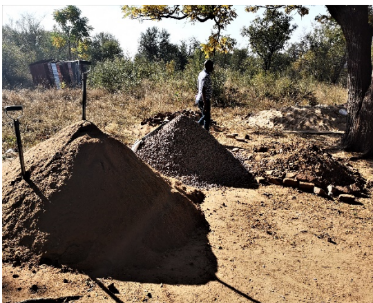
Figure 4.1: Status of construction on the day of OUTAs visit

Upon the contractor's return on 21 st May 2019, he indicated that the donors are under pressure (unexplained) and that they will no longer build according to the above plan as promised. They will now only build toilets for disabled learners. The school indicated that they didn't have students with disabilities currently nor were they going to have any in the foreseeable future.