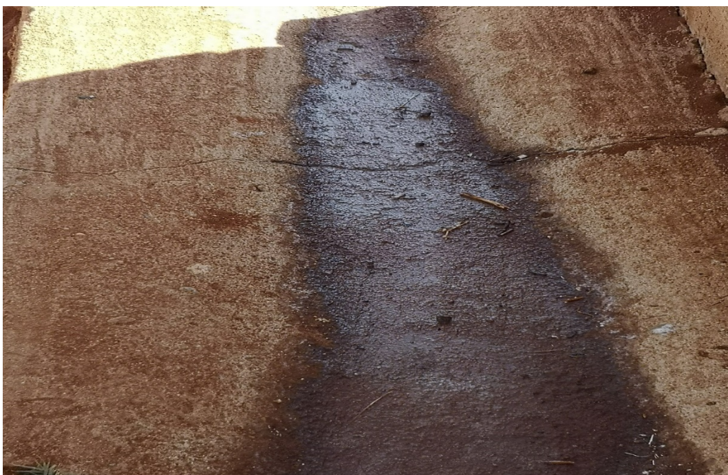
Figure 1.2: Outside – path to and from the toilets.

Current toilets used by the pupils at the school. There are four of these toilets; two per gender, serving a total of 230 learners.