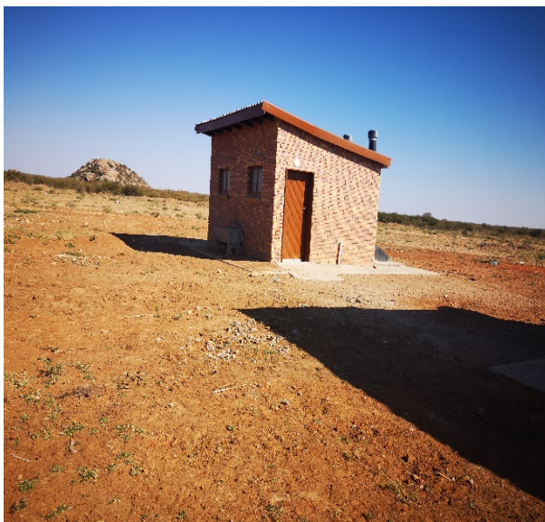
Figure 2.2: Newly built toilets

There is a total of four existing toilets (2 each for males and females), used by 345 learners and educators of Tibanefontein.