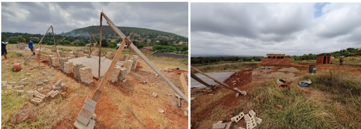
Figure 7.1 Current status of construction as at OUTA’s visit.