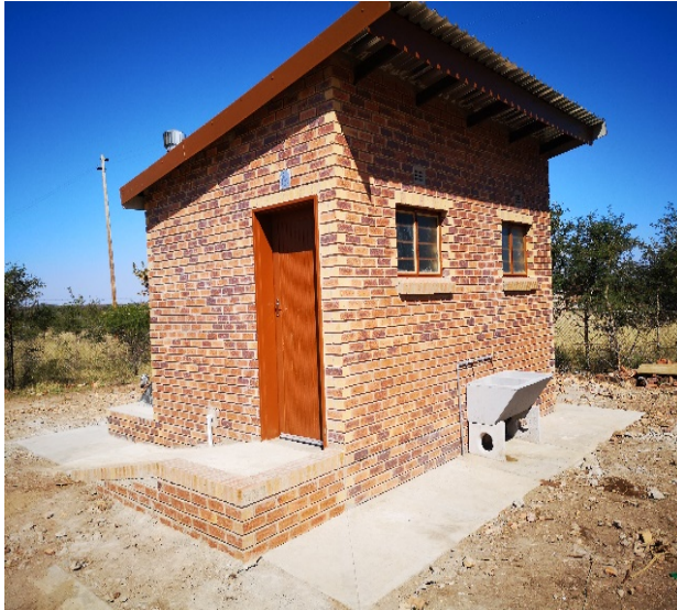
Figure 3.2 Newly constructed toilets at Ncheleleng.

These two toilets above have two seats each. This services approximately 222 learners both male and female.