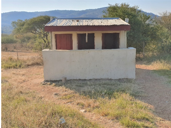
Figure 5.2: Toilets built by Thusanani Outreach Project in 2012.

These are the old toilets that were used by learners prior to the new toilets built by Thusanani Foundation in 2012.