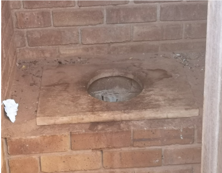
Figure 1.1: Current toilets at Ngwanabahlalerwa.

Current toilets used by the pupils at the school. There are four of these toilets; two per gender, serving a total of 230 learners.