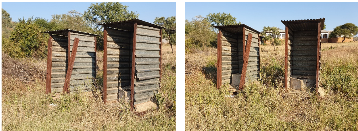
Figure 5.1: The old toilets prior to 2012.

The principal stated that they had a relationship with Thusanani Outreach Project, an NGO based in Centurion that improves schools' facilities and creates links between private and rural schooling. The Foundation started to assist them in 2012 by funding learners who were studying Physical Science and Mathematics. They also donated funds to the school in 2012 to build toilets. At the time, Thusanani wanted 3 quotations from 3 companies who could build the toilets. The school obtained the quotes and the amount required to build the cheapest toilets (Namely pit latrines), was donated to the school. To date they still engage with the organisation.