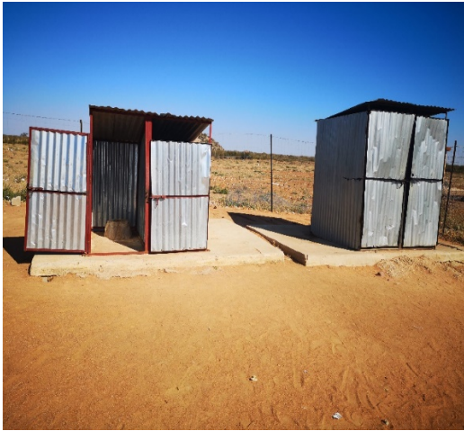
Figure 2.1: Old toilets at Tibanefotein Primary School.

After OUTA's field trip, further investigations were conducted. We had a telephone conversation with Ms Morulane on 27 May 2019. She indicated that they were appointed by Zibsifusion NPC to build toilets for two schools namely, Tibanefontein Primary and Ncheleleng Secondary School.