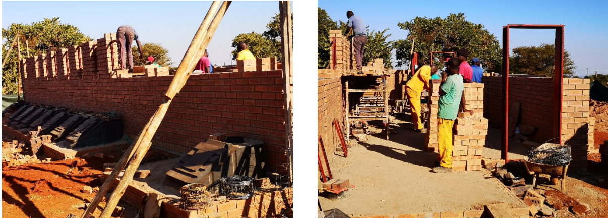
Figure 1.3 Current toilets being built with NLC funding

The funds for the building of the toilets were granted by the NLC in November 2018. Construction began in April 2019. The above is a photo of what had been achieved by 20 May 2019 when OUTA visited the site. The expected completion time was a week from date of our visit, approximately early June 2019.